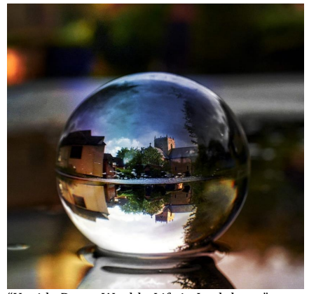
"Upside Down World - Life in Lockdown"