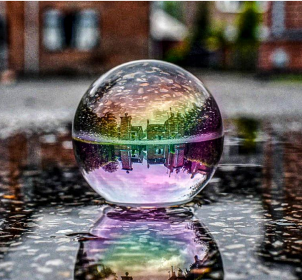
"Stay at Home, Save Lives & Support the NHS