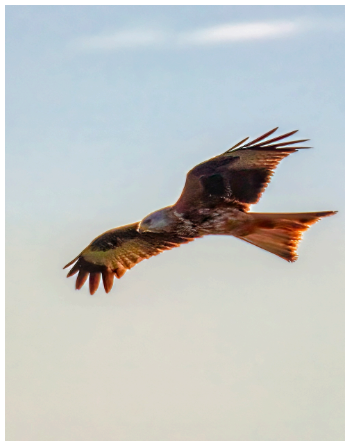
Red Kite over Stow

Non-members are welcome to attend. There will be a charge of £5.