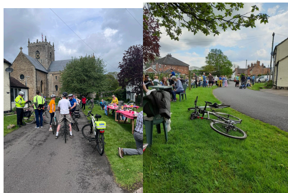
Enjoying the picnic.....