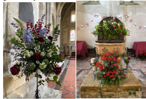
Just two of the examples of the flower displays last year.