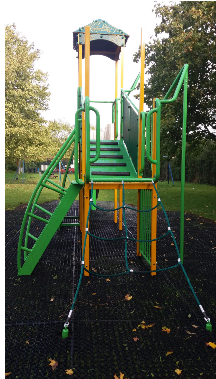
The Play Park

For those who want to celebrate Bonfire Night there is a good community bonfire and fireworks display at 6.30pm Saturday 6 th November on the Recreation field in Sturton. Parking is at Bradshaws and the school. Tickets are available from Sturton Stores and the school. Family tickets are only available in advance.