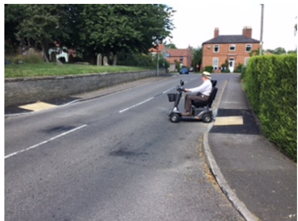
A local resident using the new crossing.