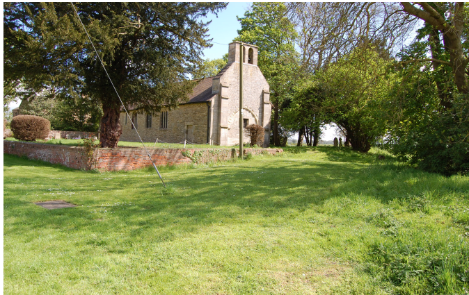
St Edith's with medieval moat to the foreground

Enjoying your daily exercise? Want a new place to visit and learn about? There is a new facility at St Edith's Church, Coates.