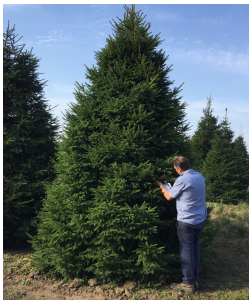
Choosing the tree

A number of local people combined to make the festive season as bright as it could be: