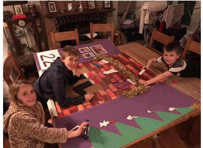
...and the family working on Day 22